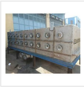
Heavy Duty SS Tank