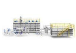
Roll Coolant Filtration System