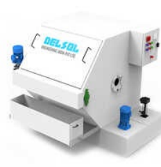
Compact Band Filter